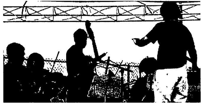
Members of the Senior Symphony perform at the "Groovin' at the Grove" festival June 2007

Download the latest version of the HPYS Handbook .